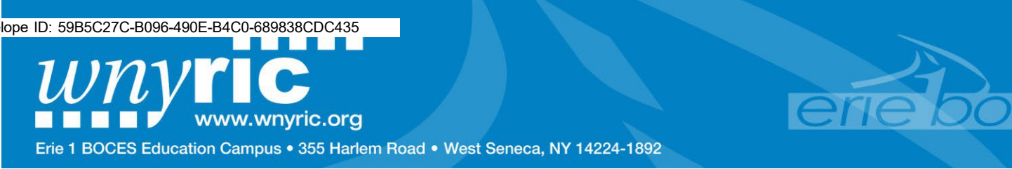
EXHIBIT D (CONTINUED)