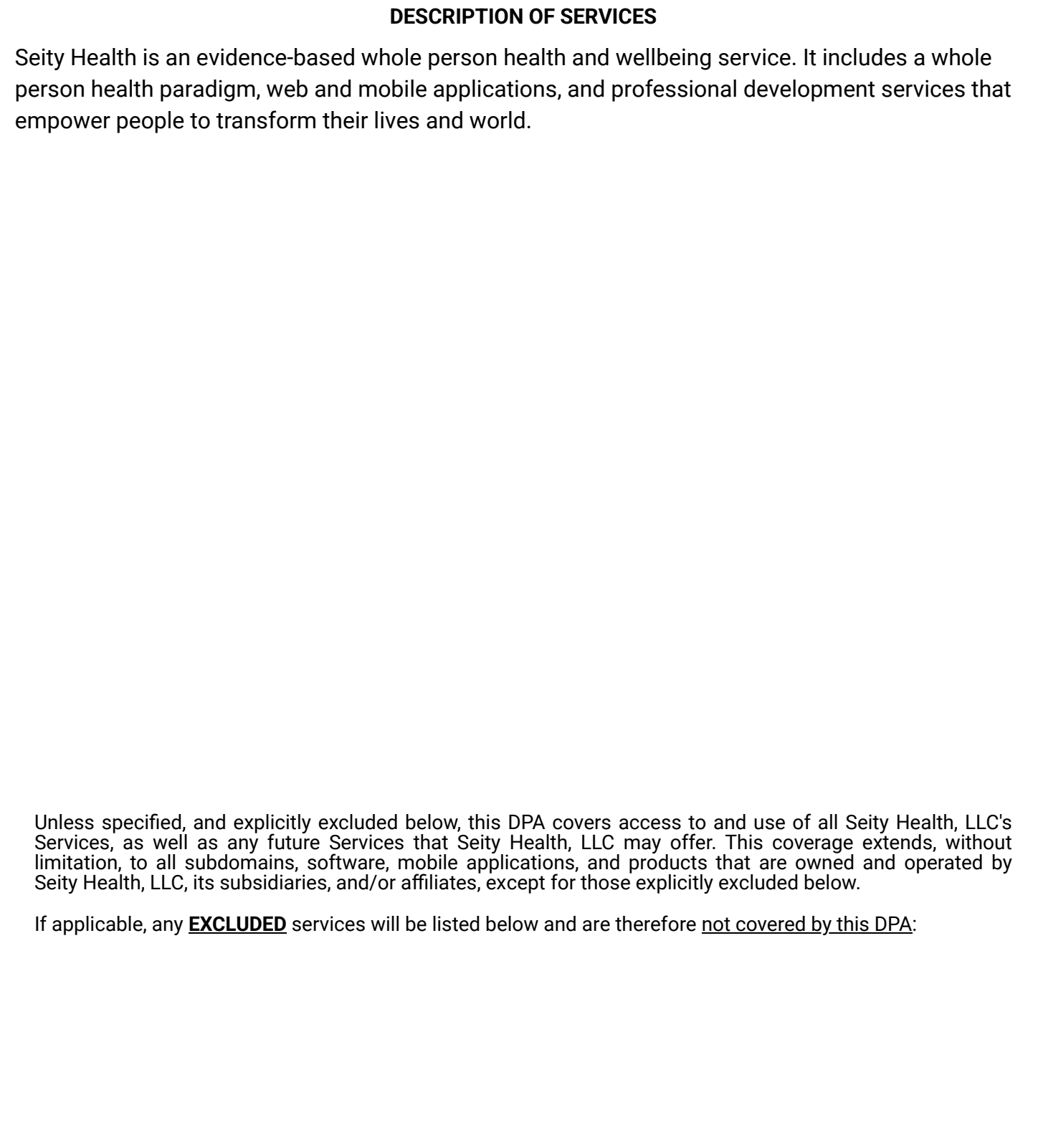
EXHIBIT "A" DESCRIPTION OF SERVICES

I have completed Exhibit "A" and, if applicable, specified any excluded Services that are not covered under this DPA.