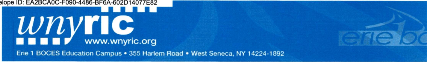
EXHIBIT D (CONTINUED)