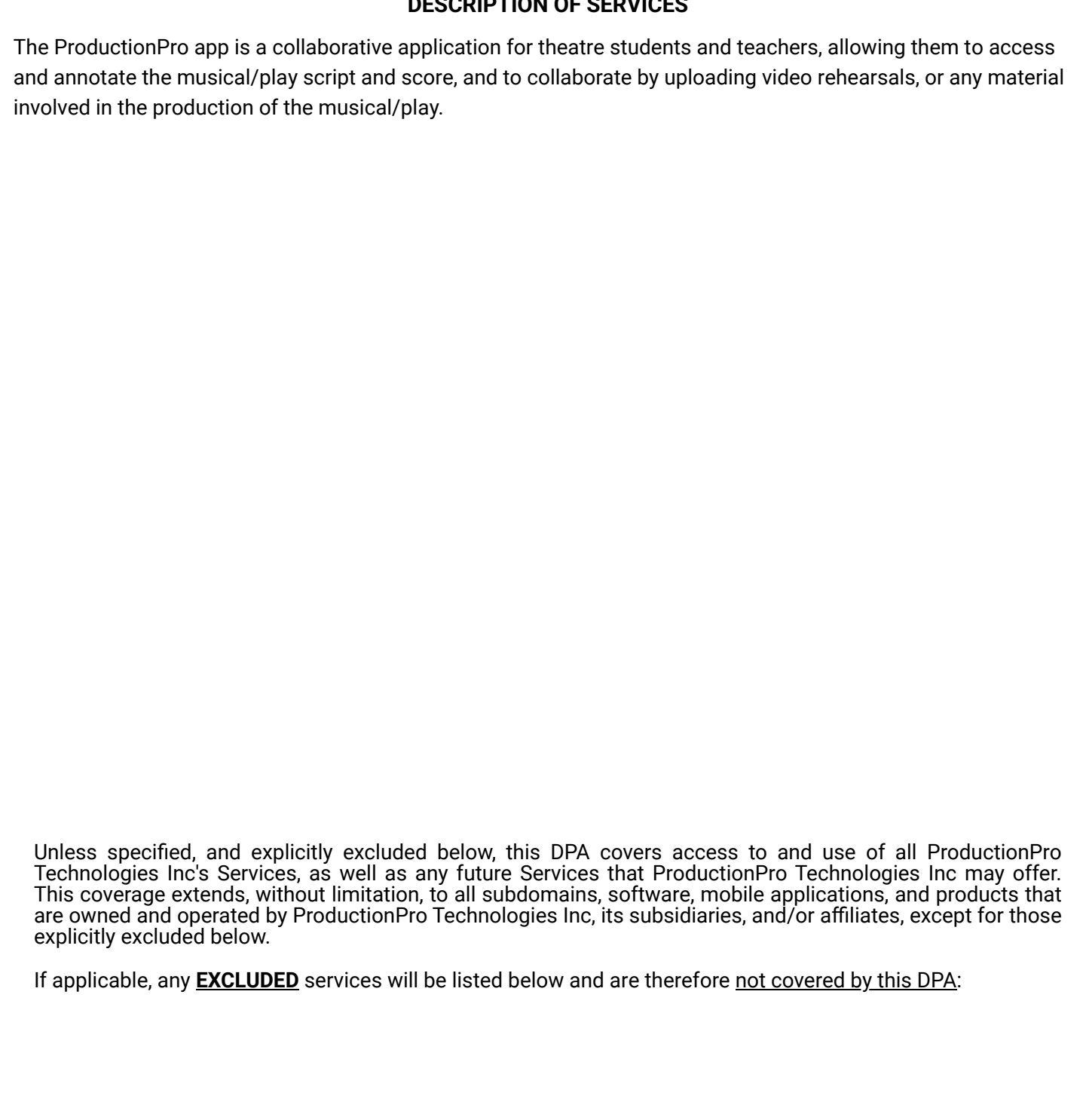
EXHIBIT "A" DESCRIPTION OF SERVICES

I have completed Exhibit "A" and, if applicable, specified any excluded Services that are not covered under this DPA.