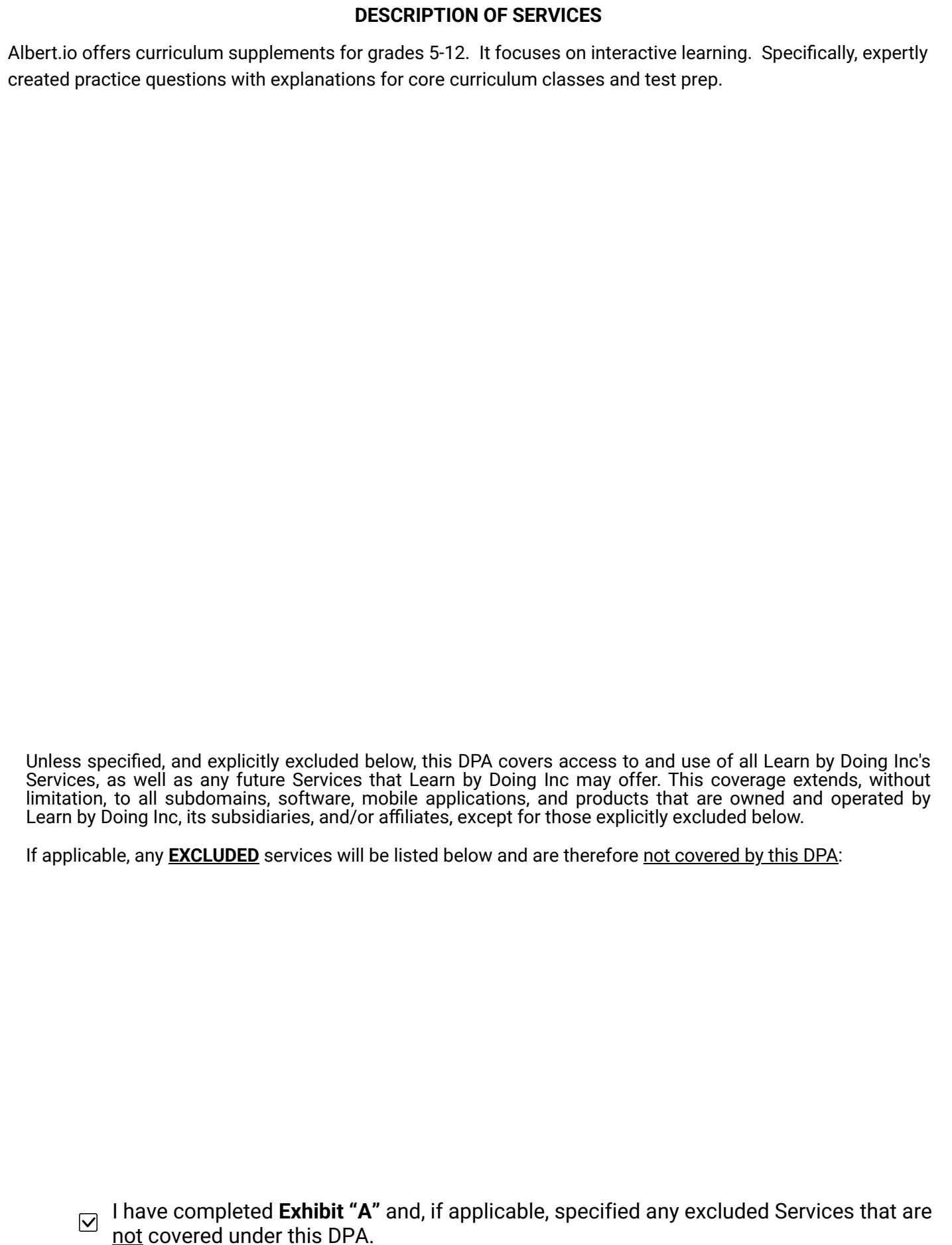
EXHIBIT "A" DESCRIPTION OF SERVICES