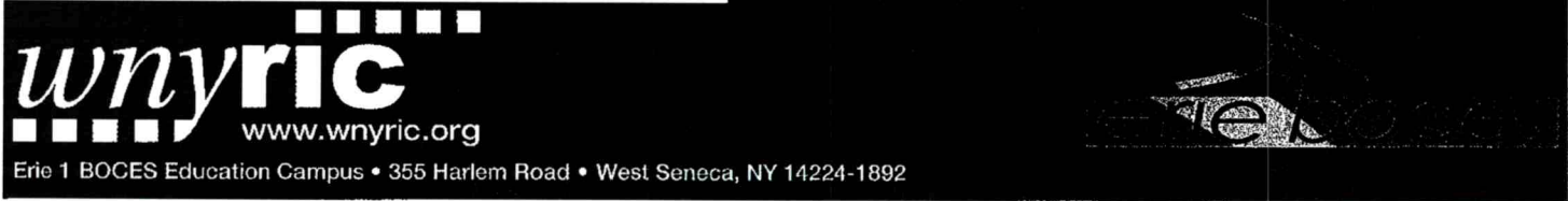
EXHIBIT D (CONTINUED)